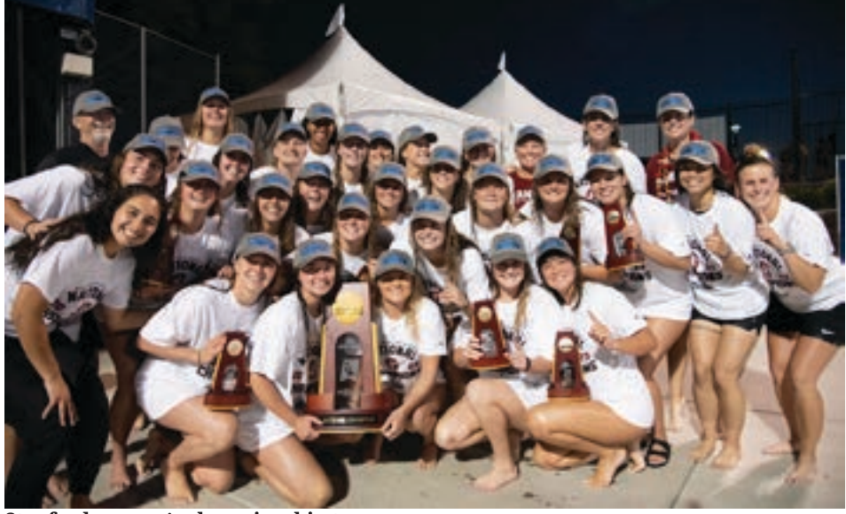
Stanford women's championship team.